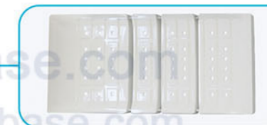
Punching Bed Board (Optional)