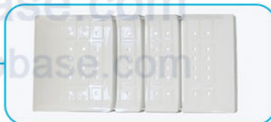
Punching Bed Board (Optional)