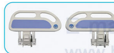
PP Guardrails (Optional)