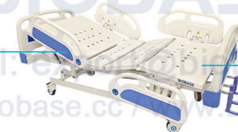
MF301S with PP guardrails and punching bed board PP guardrails and punching bed board must be optional together